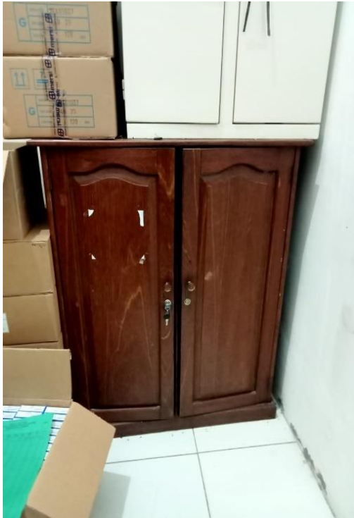
Lemari Narkotika Psikotropika