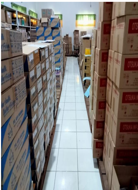
Instalasi Sistem Huruf U