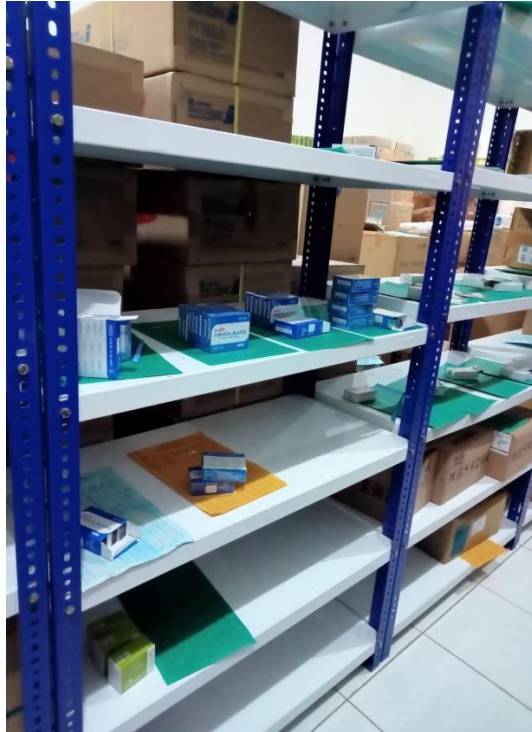
Rak Penyimpanan Obat