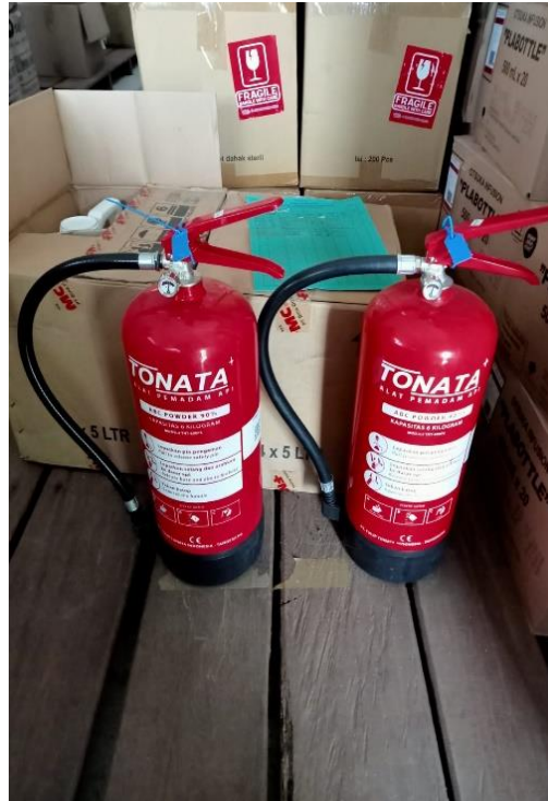
Tabung Pemadam Kebakaran